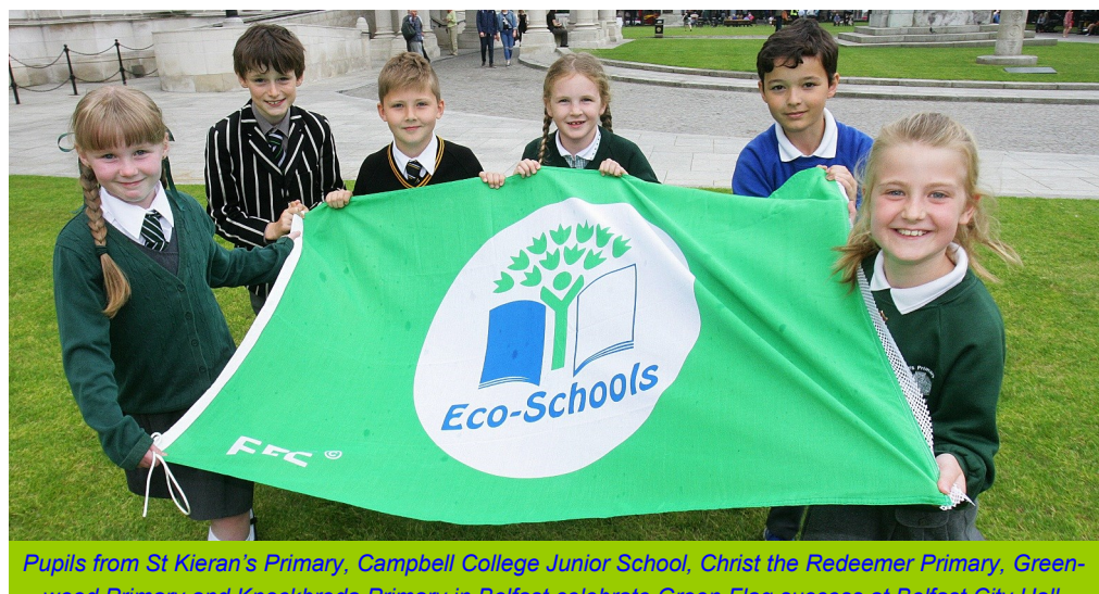
wood Primary and Knockbreda Primary in Belfast celebrate Green Flag success at Belfast City Hall.

We are looking forward to building on success this year and supporting more schools to reach Green Flag status. Keep an eye out here in the newsletter for ideas, visit our website, twitter and facebook pages for ideas and please contact us directly with any questions you may have about the programme eco-schools@keepnorthernirelandbeautiful.org.