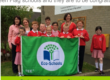
St Joseph's Primary, Strangford.

We are continually amazed at the knowledge and enthusiasm of all the pupils and staff at our Green Flag schools and they are to be congratulated on their fantastic achievement.