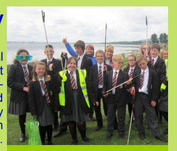
Ulidia pupils collected litter along Belfast Lough shore dur-ing their Green Day in June.

Ulidia Integrated College, Ambassador Eco-School for Global Perspectives, held their annual Green Day at the end of last term. The day involves the whole school in environmental actions, learning and fun activities. This year Ulidia were delighted to invite pupils from neighbouring Acorn Integrated Primary along to enjoy the day too. Ulidia have been mentoring Acorn who are hoping to go for their first Green Flag later this year. Green Day saw guests from Eco-Schools, Trócaire, Ulster Wildlife, QUB and ISL come along to talk to the pupils as well as a bird of prey display to round off the day. Pupils also completed litter picks and planting around the school and local community.